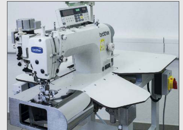
Working table shaped for ease of production