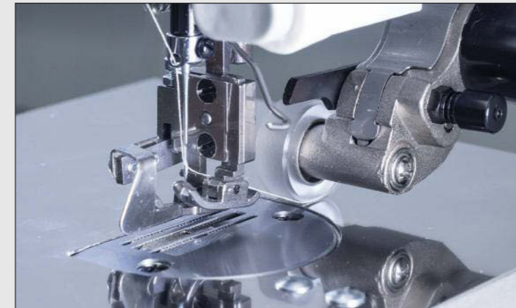
Special presser foot for stitching in the shadow of the seam