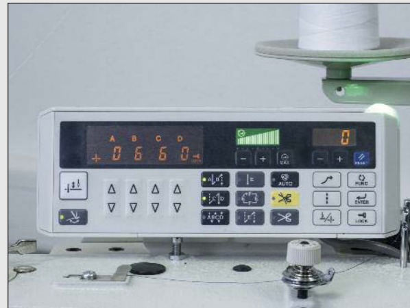
Control panel for adjusting various sewing functions

Designed workplace for stitching the waist in the seam shadow